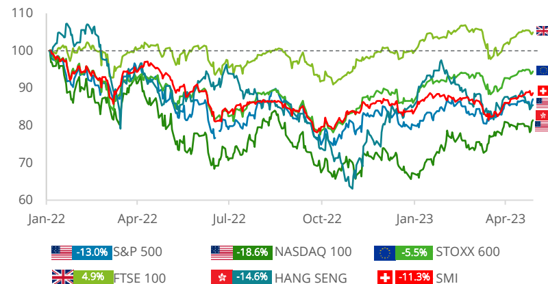
Figure 1: Global Indices Performance Jan 2022 – Apr 2023