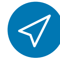
Service Delivery Model & Outsourcing Relationships