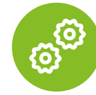
Business Continuity & Disaster Recovery

GBS leaders should respond to the current momentum and push their thinking further on designing flexible and agile processes that streamline value and business outcomes. Reimagining and redesigning 'intelligent' processes with problem-solving capabilities will help deliver the right outcomes for your business.