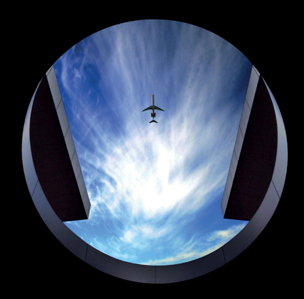
Finding a new route to value SAP S/4HANA® Finance for the airline industry