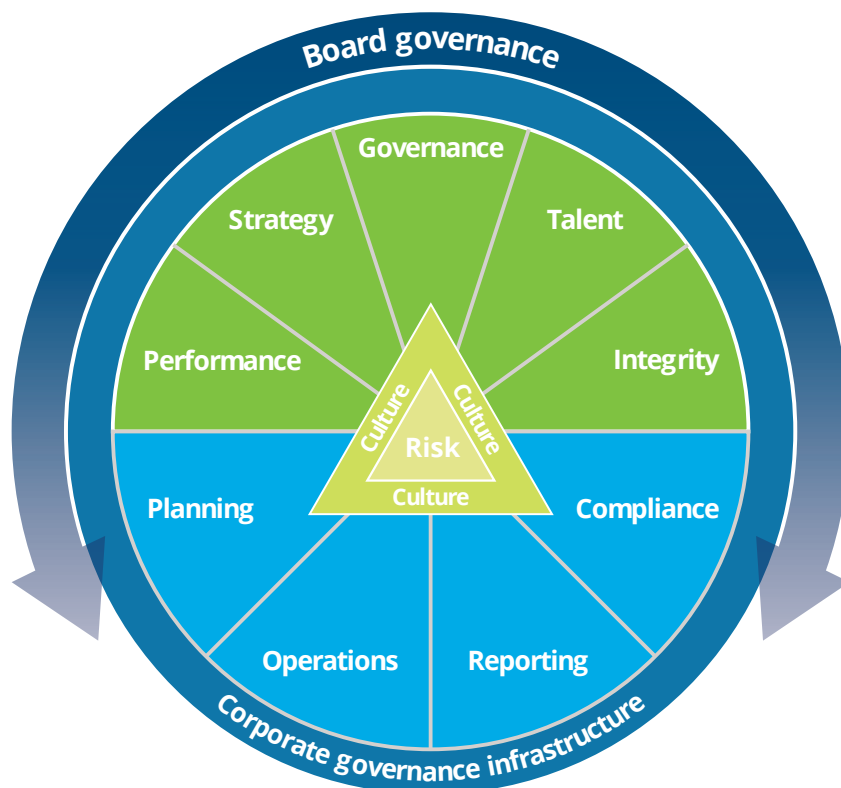
Figure 1: The Deloitte Governance Framework