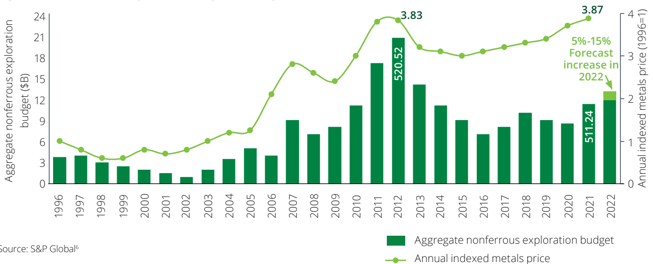
Figure 1: Indexed metals prices and exploration spend for nonferrous metals, 1996–2022

Despite these recent increases, it's important to take a step back and look at the bigger picture. The mining and metals industry is highly cyclical and exploration budgets are intrinsically linked to commodity prices (figure 1). This means that, when prices dip, exploration budgets tend to get cut (and vice versa), and the impact this volatility can have on exploration teams, the success of their programs, and, subsequently, project pipelines can be significant.